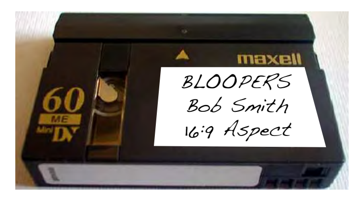
Label the tape, not the box

For a DVD put a simple menu on the DVD, this need only be a "GO BUTTON" for an orderly startup.