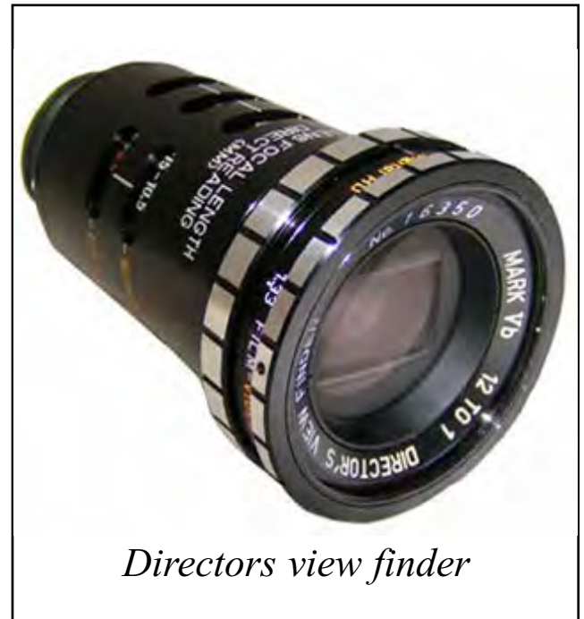
Director's view finder